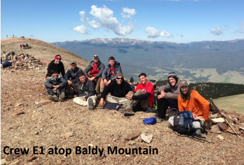
Crew E1 atop Baldy Mountain