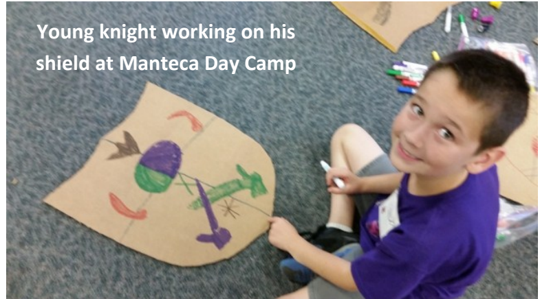
Young knight working on his shield at Manteca Day Camp