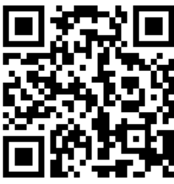
*If in the Yo-Se-Mite Chapter, scan the QR code above to check out their new website!