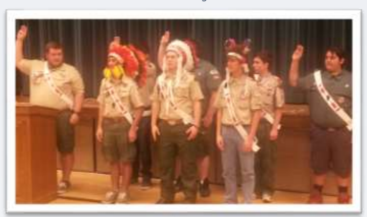
Above: The new Lodge officers being inducted. Below: Working hard at the Winter Ordeal.