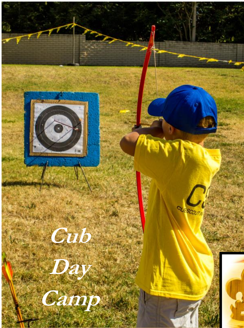
Cub Day Camp