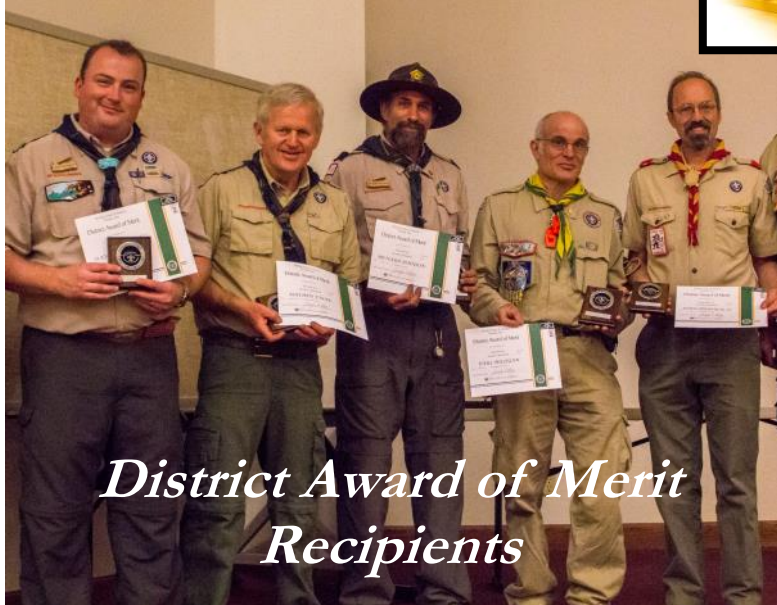
District Award of Merit Recipients