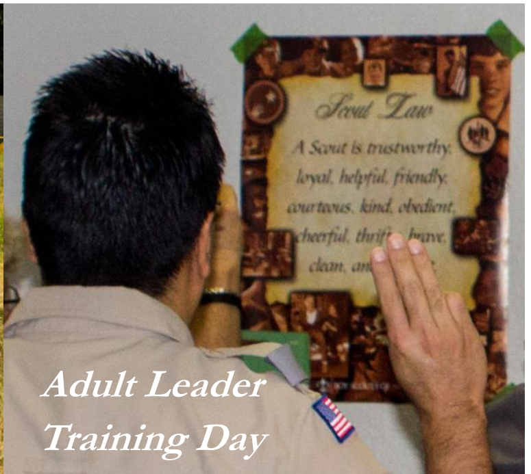
Adult Leader Training Day