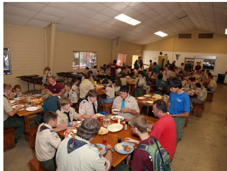
Participants eating a meal in the dining hall.

Mail is checked by either the Camp Director or Ranger every Wednesday and Friday. Mail is also picked up at varying other times depending on which staffers are leaving camp to gather supplies in Sonora and which Council employees are coming to camp. Please allow a considerable amount of time for your shipped items to arrive at camp. We are in a remote location and the mail service has multiple check points before it arrives at the location where we check mail. It might even be a good idea to ship items a week prior to your Scout's arrival. We can hold on to mail so that your participants receive it when they get to camp.