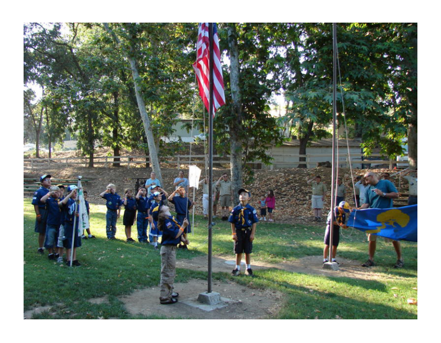
ROLES / EXPECTATIONS

Astronomy Big Splash Competition Crafts (Whittling, Woodwork) Creating Floating Cities Campfire Competition Night Disability Awareness Garden Exploration & Ecology Hiking & Nature Observation Shooting Sports (Archery, BB Guns, Tomahawks) Swimming & Water Safety Outdoor Cooking Obstacle Courses