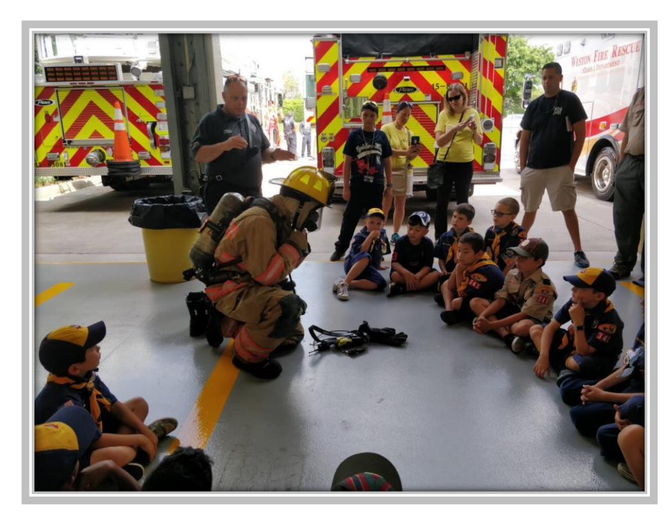
Fire Departments in Greater Yosemite Council