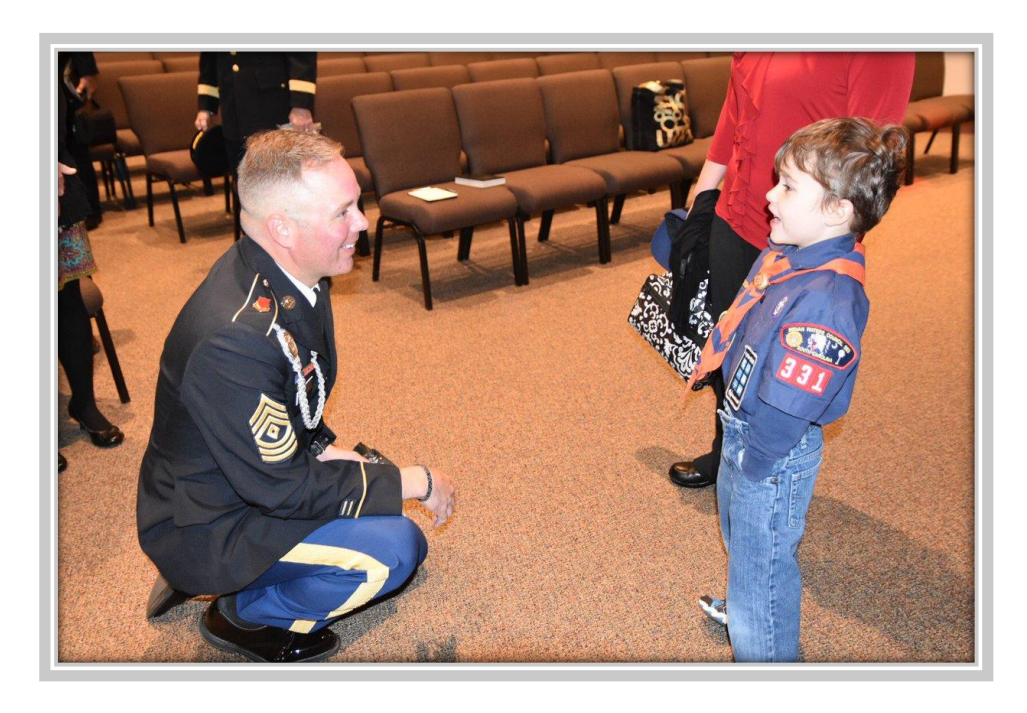
Sheriff's Departments in Greater Yosemite Council