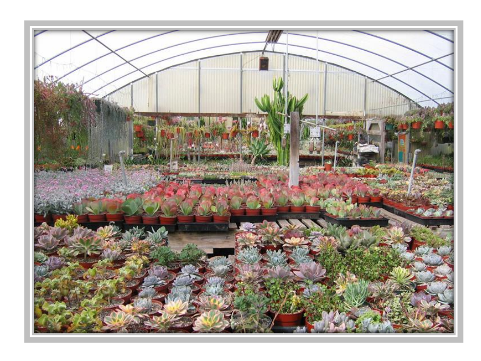
Farms, Nurseries, & Fisheries Greater Yosemite Council